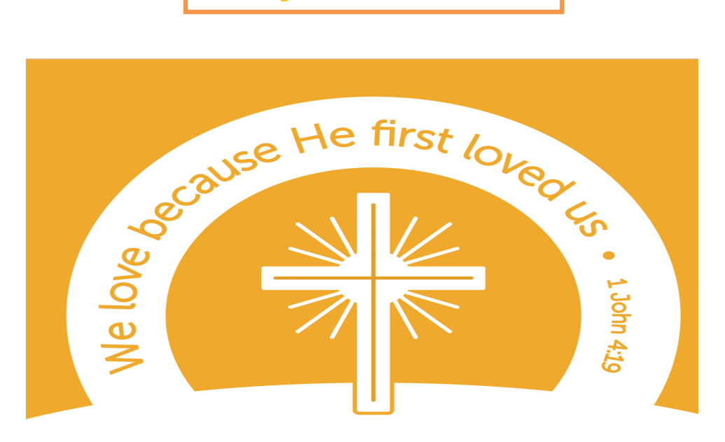
Love • Respect • Shine

At Cheadle Catholic Infant School we love and respect each other. We love to learn and let our inner light shine brightly in all that we do.