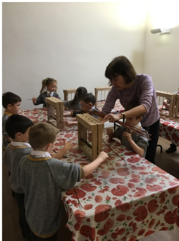
Class 1DW Bramhall Hall