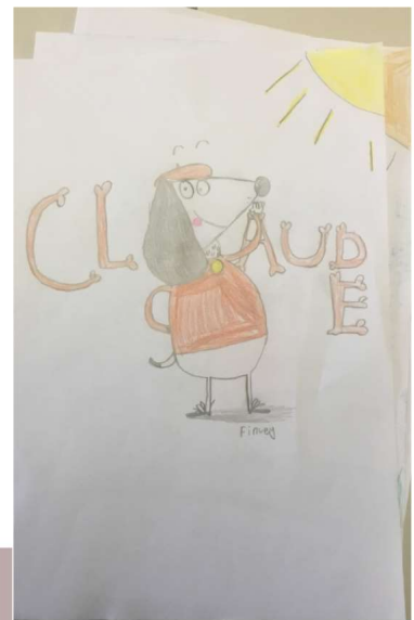
World Book Day in Year 2!