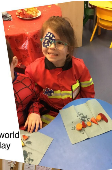
Nursery world Book day