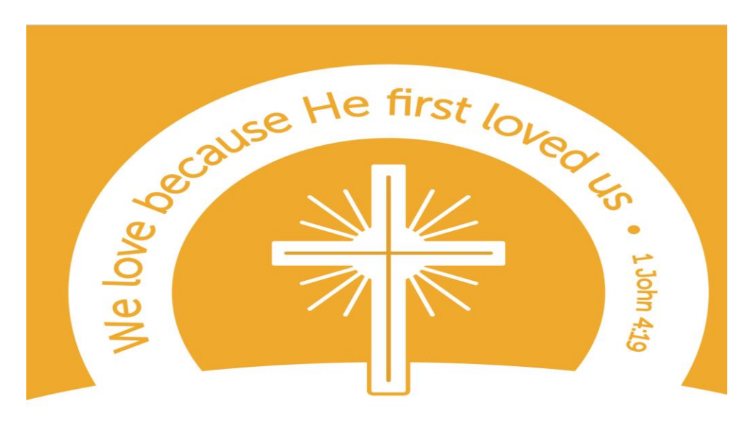
Love • Respect • Shine

At Cheadle Catholic Infant School we love and respect each other. We love to learn and let our inner light shine brightly in all that we do.