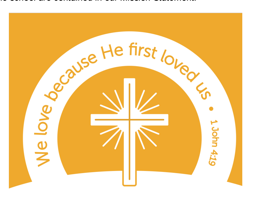
Love • Respect • Shine

The aims of the school are contained in our Mission Statement: