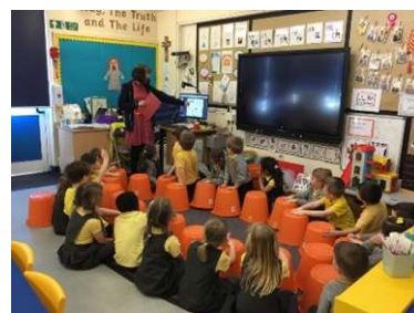
Music National Curriculum Tracking Grid - EYF5/KS1