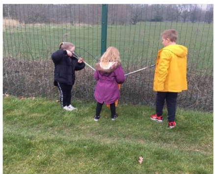
Our Year 2 Eco Warriors have been busy collecting litter for the 'Big School Clean'.