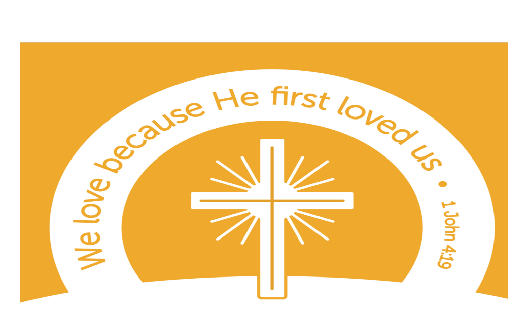
Love • Respect • Shine

At Cheadle Catholic Infant School we love and respect each other. We love to learn and let our inner light shine brightly in all that we do.